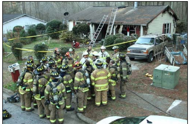
Firefighters participate in a "tailboard critique" after a house fire on Keith Drive on January 12. Engine 10 was first on scene with heavy fire showing.