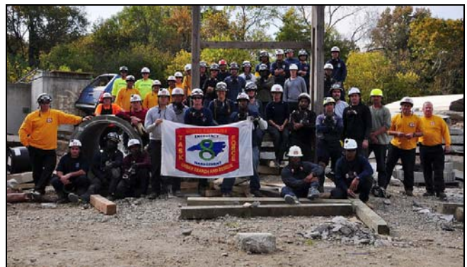
In October, a nine-day, ninety-hour Structural Collapse Technical (SCT) school was conducted at the training center by and for members of North Carolina USAR Task Force 8. The task force is comprised of firefighters from Raleigh, Durham, and Chapel Hill and medics from Wake County EMS.