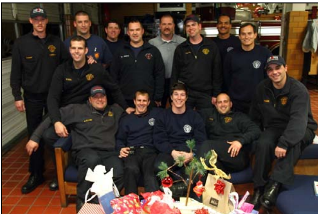
Station 1 personnel on "B" platoon posed with their "Charlie Brown Christmas tree" and "white elephant" gifts on Dec. 25.