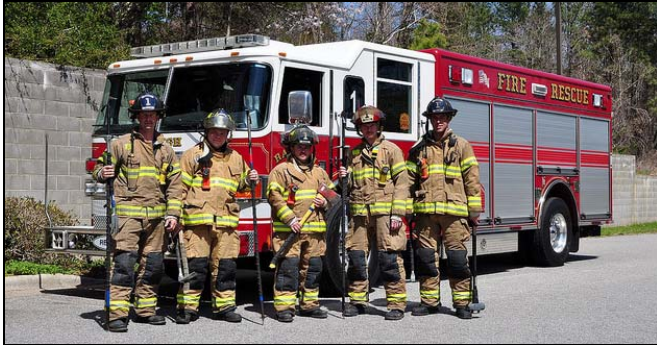
Rescue 1 with A platoon.

On Tuesday, February 5, a heavy rescue company and two squad companies were placed in service.