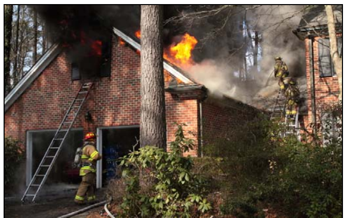
Engine 9 was first on scene at 122 Lakestone Drive on Jan. 27. Heavy smoke and soon fire was showing from a two-story, semi-detached garage. The fire was controlled in thirty-seven minutes, and with no extension to the rest of the single-family dwelling.