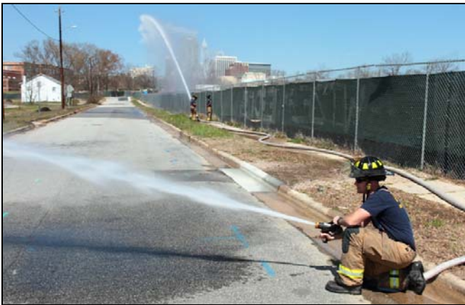
"B" platoon members practice pump and nozzle operations on Walnut Street on Mar. 30, beside the new housing community under construction across the street from the Keeter Training Center.