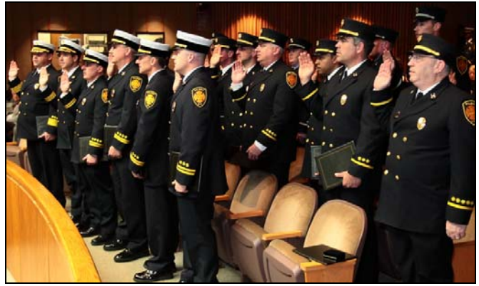
Twenty-seven recently promoted and appointed members were honored in a ceremony at City Council Chambers on Friday, Feb 16. The event was originally scheduled in January, but delayed due to weather.