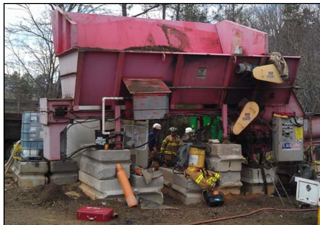
Mulch hopper extrication, Gresham Lake Road.

A safety perimeter was established, a staging area designated for incoming units, and the first Rescue Group designated with two firefighters performing a survey of the accident site.