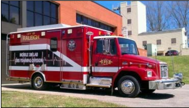
Mobile Simulation Lab.

The EMS Division placed a mobile simulator lab in service as Car 521 on March 6. The former reserve rescue unit, a 2000 Freightliner/American LaFrance, is used as a mobile classroom for EMT recertification.