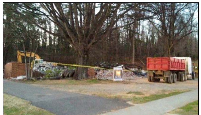
Demolition underway.

Old Station 4 on Wake Forest Road was demolished in March. A mattress store is planned for the site. The fire station operated from 1963 to 1993, and remained a city office space until 1997. It later housed a software company. ■